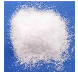
Potassium Magnesium Sulphate Powder