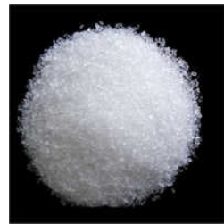
Magnesium Sulphate Heptahydrate Granule