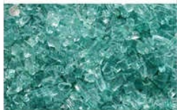
Ferrous Sulphate Crystal