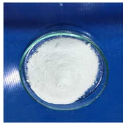
85 Percent Soda Ash Sodium Carbonate Off