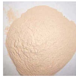
Manganese Carbonate Powder