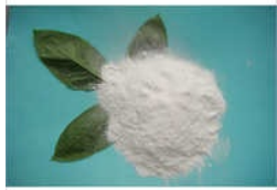
Zinc Sulphate Powder