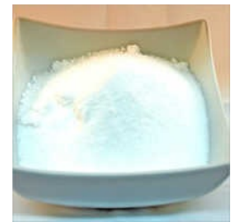
Ammonium Carbonate Powder