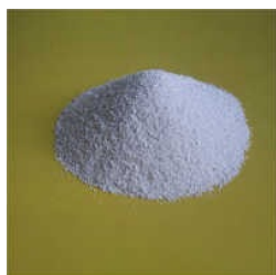
POTASSIUM SULPHATE POWDER

2 Naphthoxy Acetic Acid – Beta Naphthoxy Acetic Acid, 85 Percent Soda Ash Sodium Carbonate Off White Powder, 90 Percent Hydrated Lime Powder Neutralizing Agent, Acid Slurry, Agricultural Grade Potassium Sulphate, Ammonium Bisulphate Powder, Ammonium Carbonate Powder, Ammonium Chloride, Ammonium Sulphate Powder, Bio BPH (Brown Plant Hopper) Control Pesticides for Paddy Rice, Bio Potash Powder, Blue Copper Sulphate, Calcium Carbonate, Calcium Chloride Granule, Calcium Chloride Lumps, etc.