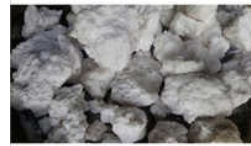
Calcium Chloride Lumps