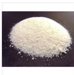
POTASSIUM NITRATE CRYSTAL