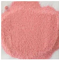
NPK Water Soluble Fertilizer