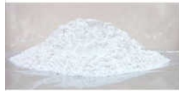
White Limestone Powder