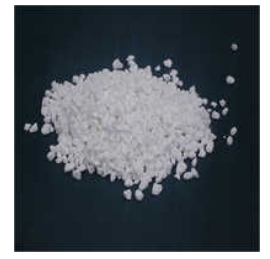
Calcium Chloride Granule