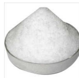
POTASSIUM CHLORIDE POWDER