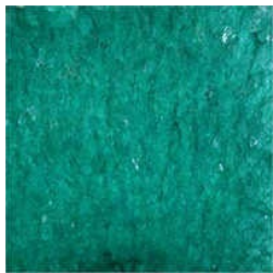
Ferrous Sulphate Powder